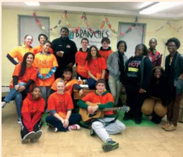
>> Immaculate Conception High School, Lodi, New Jersey; alumnae of Academy of Our Lady of Mount Carmel.

"On the night of Oct. 22, 2013, our BRANCHES High School Youth Group from Our Lady of Mount Carmel and St. Thérèse slept in cardboard boxes. We were raising awareness for homelessness. The teens were told to bring enough cardboard and duct tape to build their "houses" on the grounds of St. Thérèse. We finished in time to attend 5 p.m. Mass. After Mass, we went to the St. Thérèse Youth House, where we listened to young adults from the Covenant House of Newark, an outreach ministry to homeless youth. The Covenant House visitors talked about their personal experiences being homeless. The teens and visitors spoke with each other for about two hours and we found out that amazing